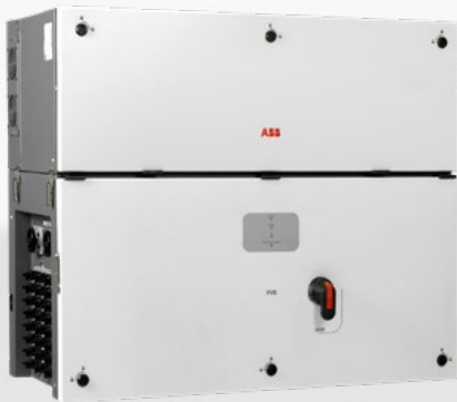
— PVS-100/120-TL three-phase outdoor string inverter

This platform, for extreme high power string inverters with power ratings up to 120 kW, maximizes the ROI for decentralized ground mounted and large rooftop applications. With six MPPT energy harvesting is optimized even in shading situations.